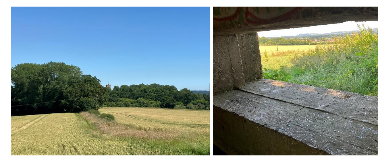
Views towards St Mary's Church

We have also been able to enjoy some of the glorious sunny weather we enjoyed during June when out and about on foot patrol.