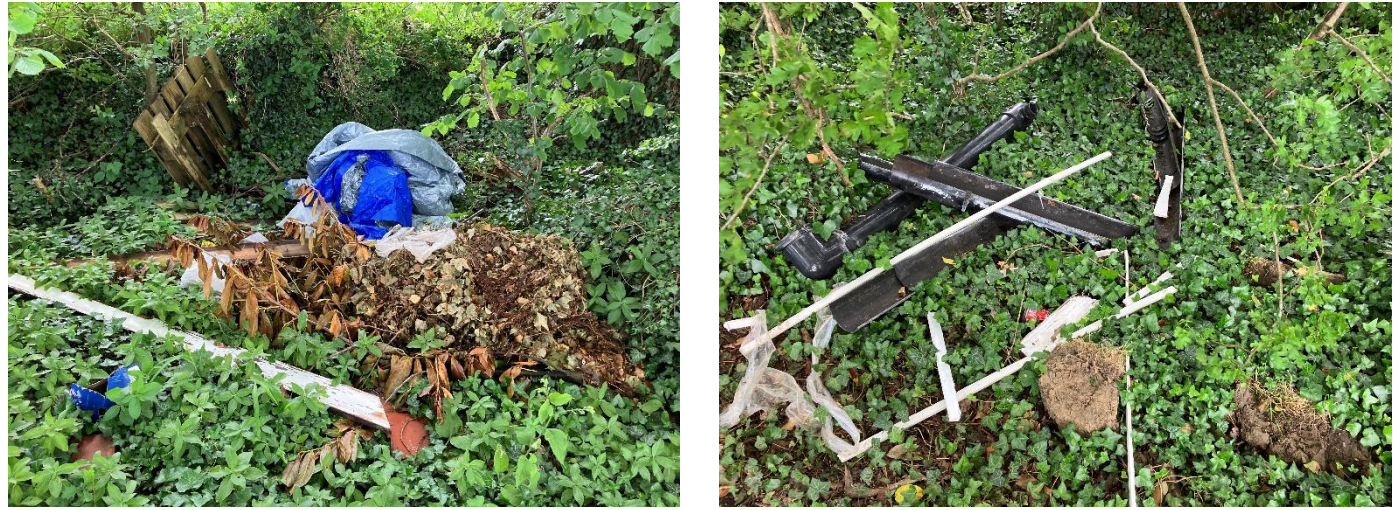
Fly tipping found at Nutbourne Lane and reported for removal.

If you witness fly tipping in action, please call Sussex Police and if possible, provide them with the registration of the offending vehicle and subsequently any relevant dash cam footage you may have. You can also report it direct to HDC at: <u>https://www.horsham.gov.uk/waste-recycling-and-bins/litter-and-street-cleaning/fly-tipping</u>