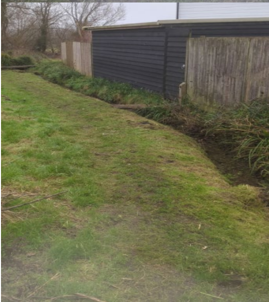
Clearing the edge of the lane next to our allotments: