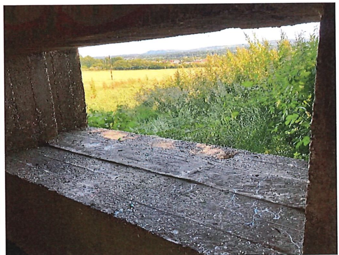
A check on the World War II Gun Emplacement