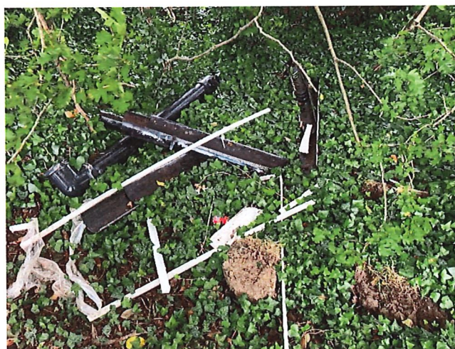
Fly tipping found at Nutbourne Lane and reported for removal.

If you witness fly tipping in action, please call Sussex Police and if possible, provide them with the registration of the offending vehicle and subsequently any relevant dash cam footage you may have.