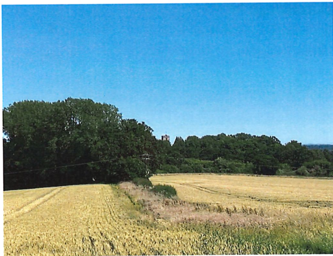
Views towards St Mary's Church

We have also been able to enjoy some of the glorious sunny weather we enjoyed during June when out and about on foot patrol.