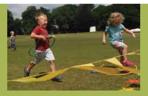
the Pre-School please visit our website www.pulboroughvillagepreschool. weebly.com

Autumn term starts on Monday 5th September and the Pre-School will now be opening from 8.45am each morning. There are still a few spaces available for next term. For more information about