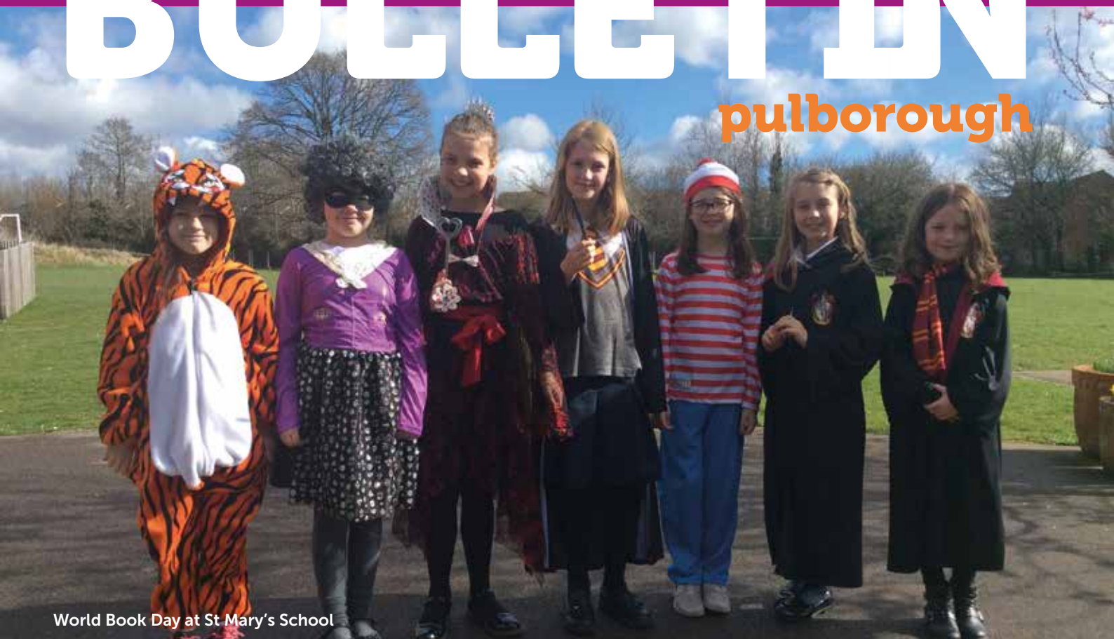
World Book Day at St Mary's School