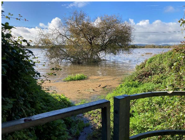
Bottom of Rivermead Nature Reserve leading to the Brooks

As part of our regular foot and vehicle patrols, we have been keeping a close eye on the Parish in particular the water levels of late which have been causing issues in the area amongst roads and some building and businesses.