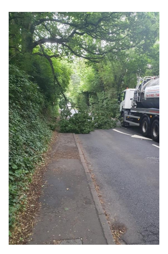
Tree branch down at Sopers on the A29

We were interested to see lots of comments appear on the Pulborough Village Group Facebook page about a large tree branch that had come down on the A29 opposite Sopers Cottages, but not one report had been made directly to West Sussex County Council Highways department!