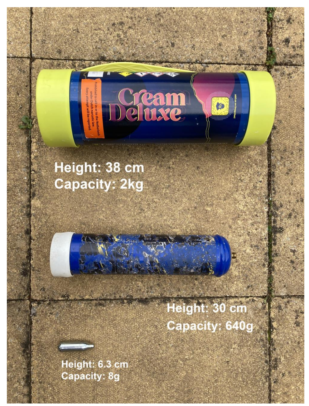
Nitrous oxide canisters recovered in Pulborough

One of the drugs we have seen an increase of has been Nitrous oxide and the canisters pictured above have been found discarded around the Parish, often alongside the remains of balloons which are inflated with the gas and then inhaled by the user. Nitrous oxide is used legally in food production but is more commonly being used on the streets illegally as a recreational drug.