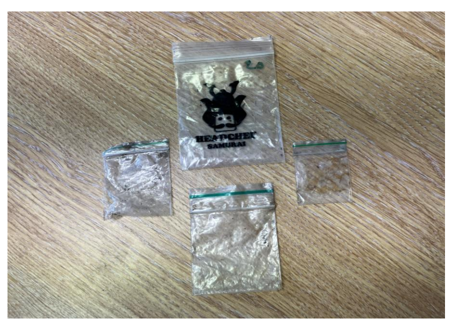
Discarded drugs baggies

Although the gas has been legal in the past, since the Psychoactive Substances Act came into effect on May 26, 2016, it is now illegal to supply or import nitrous oxide for human consumption.