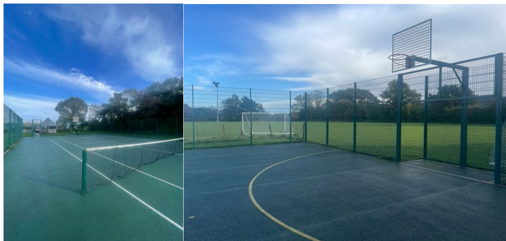
Proposed Visuals (Similar MUGA design in Lewes)

The Pulborough MUGA Renewal Project aims to transform an existing facility into a vibrant, well-maintained, and sustainable sports resource. By engaging the community, local sponsors, and relevant institutions, the project will provide invaluable benefits, not only in terms of improved sports facilities but also in creating a more connected and engaged community. The long-term benefits will serve the community and the surrounding district for years to come.