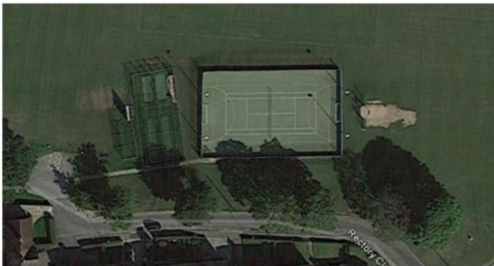
EXISTING MUGA 36.6m x 23m (841sqm)