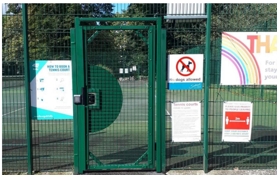
Proposed Electronic Gate