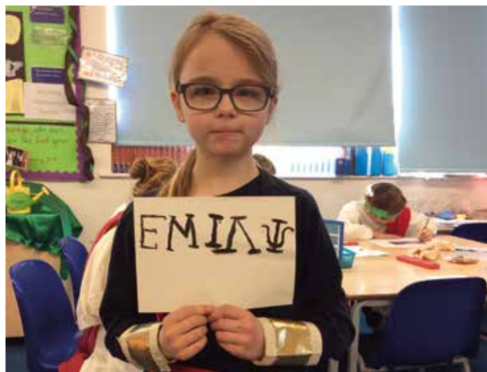
The children learnt the Greek alphabet and how to write their names.