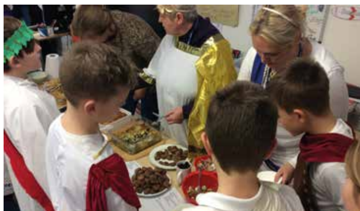
A Greek banquet was held after the children made a variety of Greek dishes.

The Spring term has started and we have a lot planned with the Polar Explorer STEM initiative and enhanced Science across the school, cornet lessons, Greek Day for Year 5, the choir heading to the O2 to participate, World Book Day, visitors to enrich the curriculum as well as Forest Schools and additional sports activities before school and at lunchtimes.