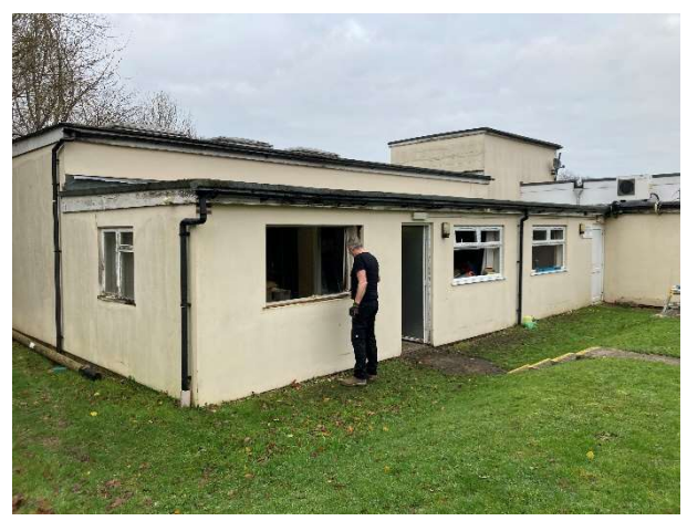
New windows being installed