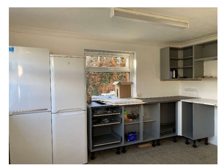
Wall and base units and worktops fitted