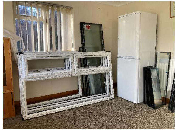
New windows ready for installation