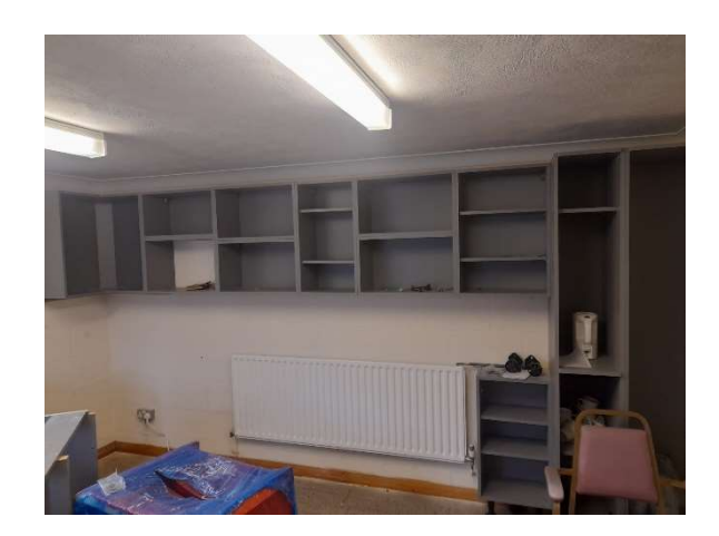
Units going in