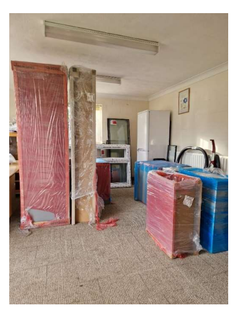
Units courtesy of Howdens Billingshurst