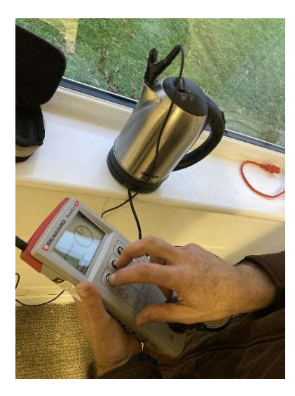
Appliances being PAT tested