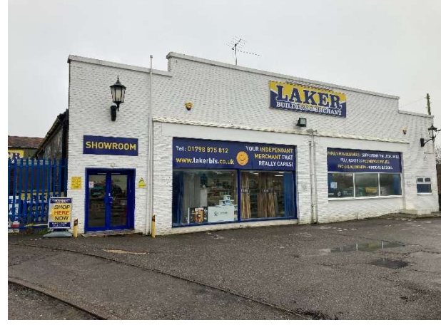
Decorating supplies kindly donated by Laker Builders Merchant