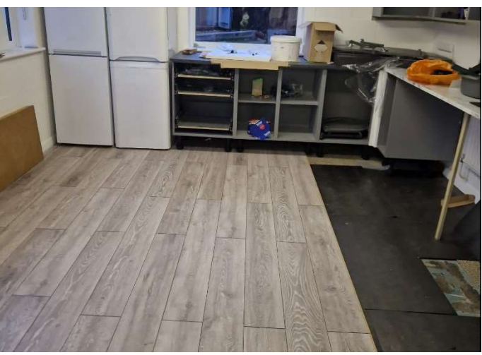
Wall and base units and worktops fitted