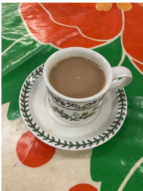
The perfect cuppa?