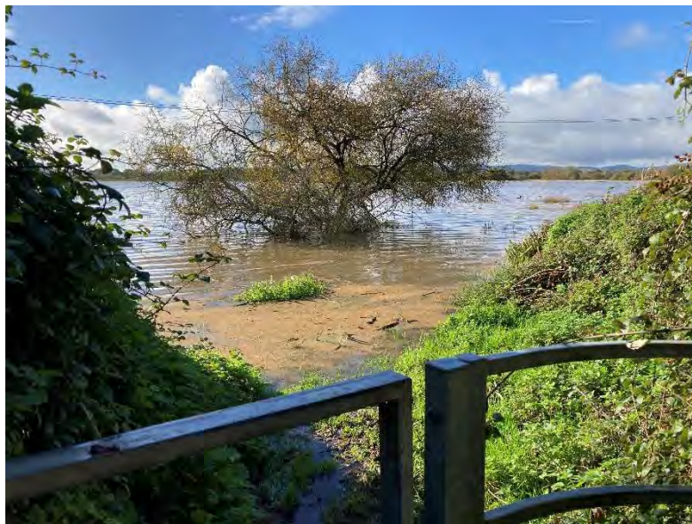
Bottom of Rivermead Nature Reserve leading to the Brooks

As part of our regular foot and vehicle patrols, we have been keeping a close eye on the Parish in particular the water levels of late which have been causing issues in the area amongst roads and some building and businesses.